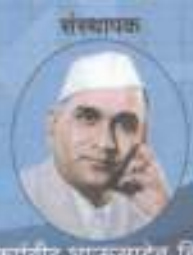
कर्मवीर भाऊसाहेब हिरे